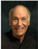
Jay Conrad Levinson