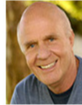
Dr. Wayne W. Dyer

Millions Of People Have Already Benefitted!